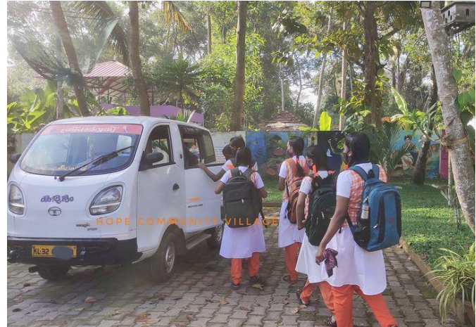
Regular classes re-start for Y10 & Y12